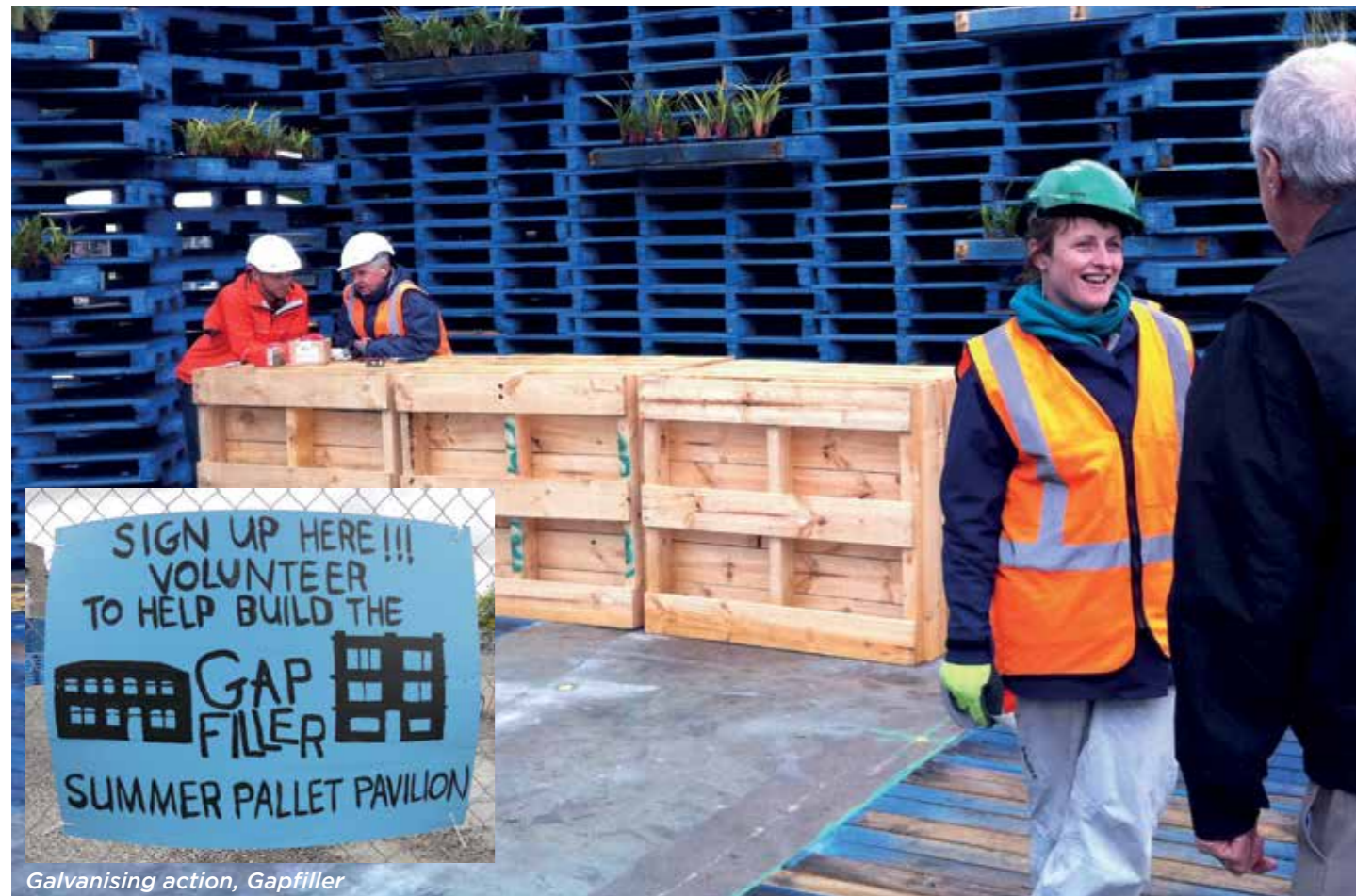
Galvanising action, Gapfiller

Christmas nativity scene for a heavily damaged church for Christmas. Others knitted covers - with fun and heart warming messages - for shipping containers that had been placed to catch falling rocks and boulders. Facebook was the major connector for this organic organising! 5