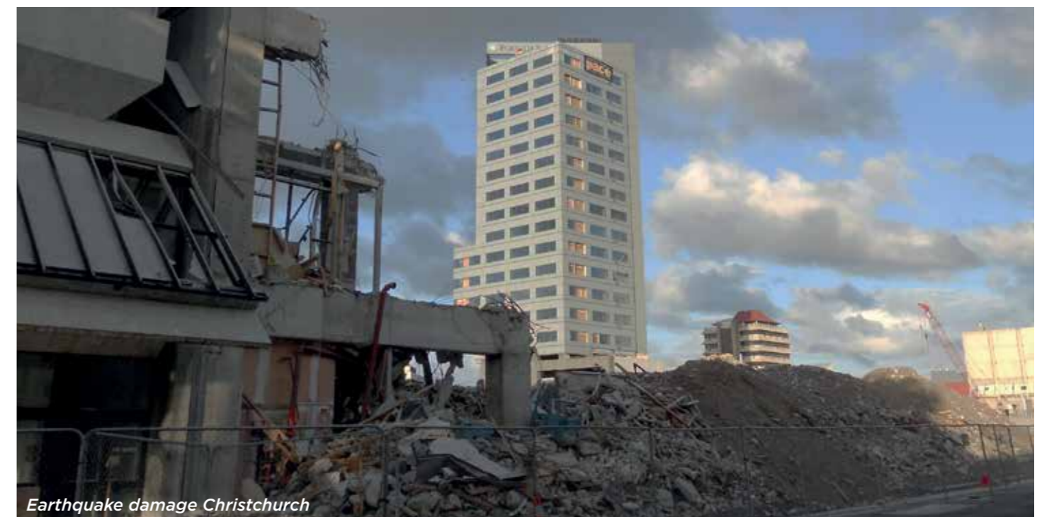
Earthquake damage Christchurch