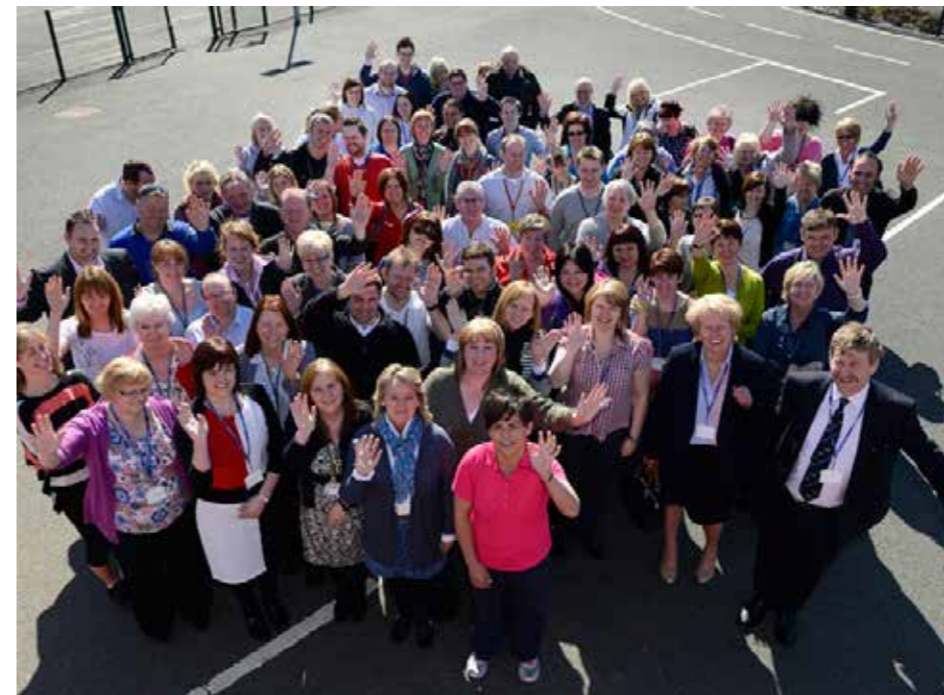
The Vibrant Communities team.

stewardship; and also to offer colleagues right across the council to become assets practitioners whatever their roles.