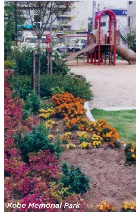
Kobe Memorial Park