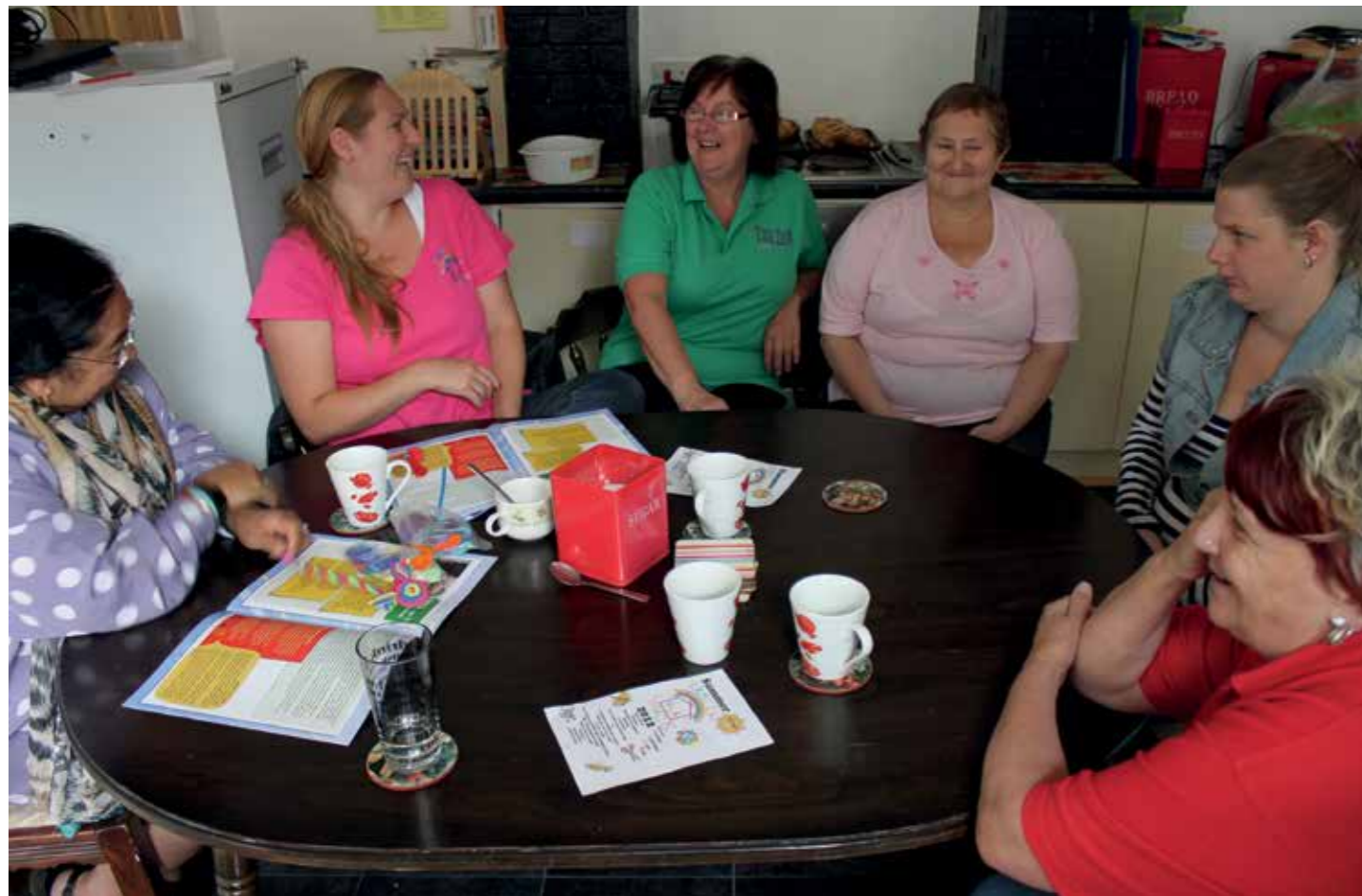
Local mums – creators of 'The Den' youth club

With only one dedicated Emergency Planning Manager, we felt that for community resilience to be more formally