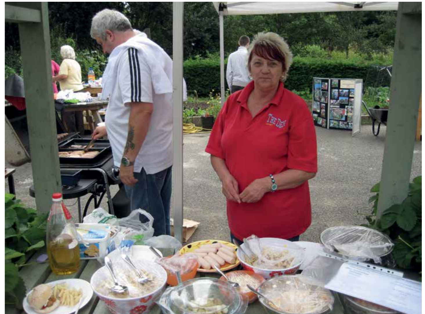
Cooking for resilience!

developed it had to be understood and supported by those already working within communities.