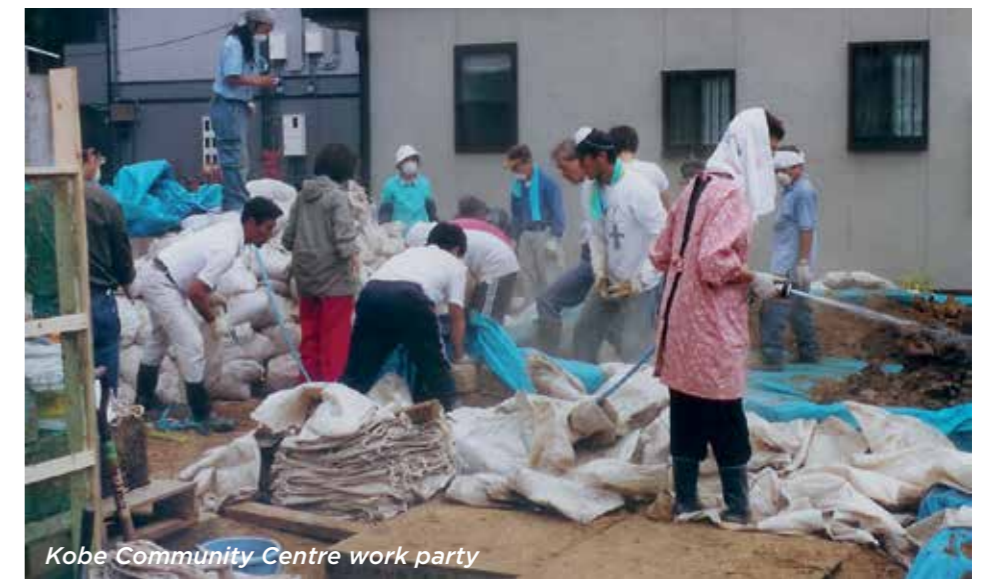
Kobe Community Centre work party